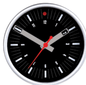
7008zw – 7009zw- 7010zw – Uhr Kidding - nXt